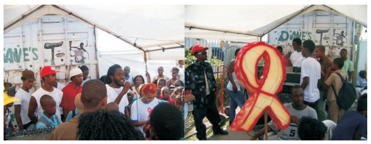
Safer sex week outreach in Gregory Park

Safer Sex Week 2008 (February 14, 15): The BCC teams were deployed to two KSA-based communities at Gregory Park and Braeton equipped with information and interactive activities using the slogan: Condom is a Mus, Know Yu' Status'. Partners in the national HIV/AIDS response – HEART Trust NTA, Children First, Rise Life Management, Jamaica AIDS Support for Life and the Women's Centre - united with the NHP and the National AIDS Committee. There were opportunities for free HIV testing and rewards for correct responses during booth interactions. There was a high level of community participation in condom skill races and condom durability contests among other events. The Bashy Bus Kru also provided entertainment. Over the two days, 485 persons were tested for HIV and offered pre and post test counselling.